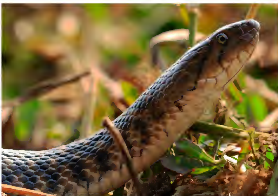
Fig. 2O. Checkered Keelback Xenochrophis piscator .

and Bengal Monitor Varanus bengalensis were seen occasionally in the study area. Among snakes, Checkered Keelback Xenochrophis piscator was recorded very often in the edges of wetland habitat followed by Red Sand Boa Eryx johnii , which was seen occasionally in woodland habitat, whereas Common Wolf Snake Lycodon aulicus , Common Indian Krait Bungarus caeruleus , and Spectacled Cobra Naja naja were recorded seen rarely during the study period. Among reptiles, turtles were mostly documented in the edges of wetland, marshland, and occasionally in grassland habitats, whereas other reptiles, including lizards and snakes, were recorded in woodland and grassland habitats in the study area.